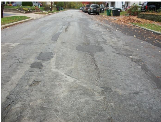
Main Street – Before

This week, paving on Main, Wall and Chestnut Street was completed much to the appreciation of the area residents. This project which has been in the works for many years is nearing completion with the new traffic signal poles anticipated to be install in the near future.