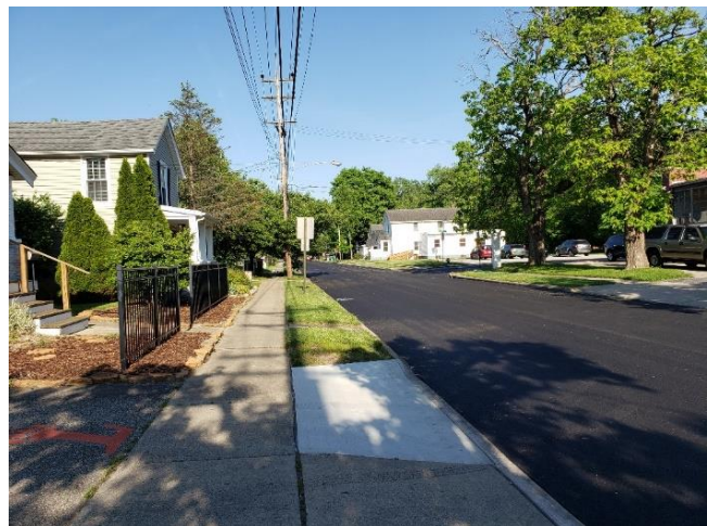
Main Street - After