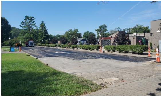
Paving of Downtown Parking Lot