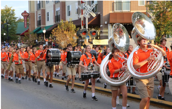
The Annual LAB Homecoming Parade Marches Through Downtown Loveland