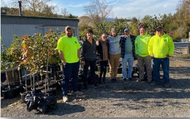
Members of the Tree & Environment Committee and employees from the Public Works Department administer this year's Free Tree Giveaway Program.