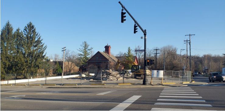
Former Mobil Station in Downtown District is razed making way for future traffic improvements