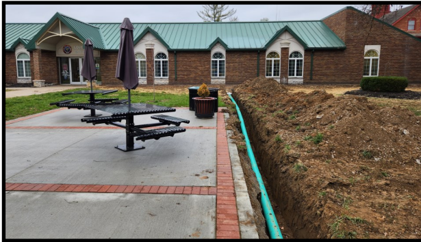
Improvements at City Hall continue as foundation drains are installed