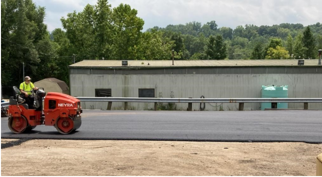
Paving within the Public Works Campus began this week.