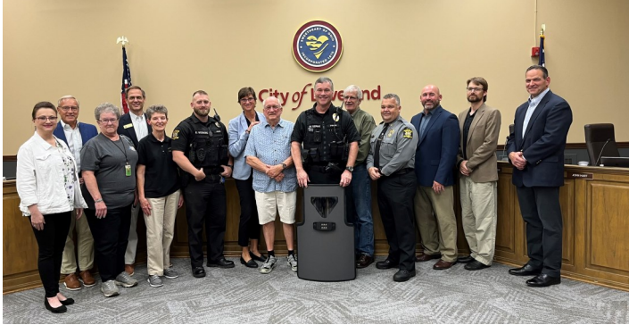
Loveland Citizens Police Academy Donates a Tactical Shield