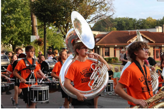
The 2024 Homecoming Parade Worked Its Way Through Downtown on Thursday