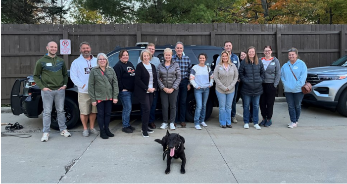
Loveland Police Department Hosted Loveland U