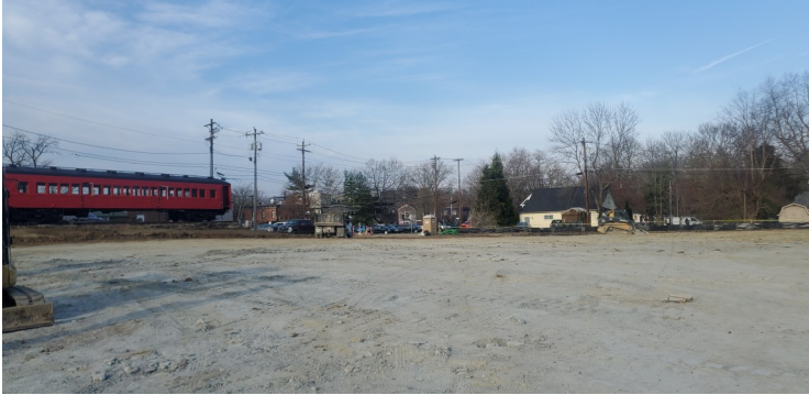
Grading at the new Downtown Parking Lot is nearing completion