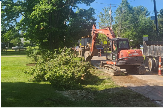
Loveland Miami Road Sidewalks Phase II began this week