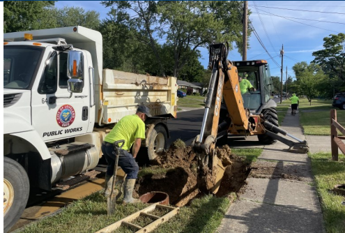
Public Works Crews repaired a water main on Marbea Drive this week