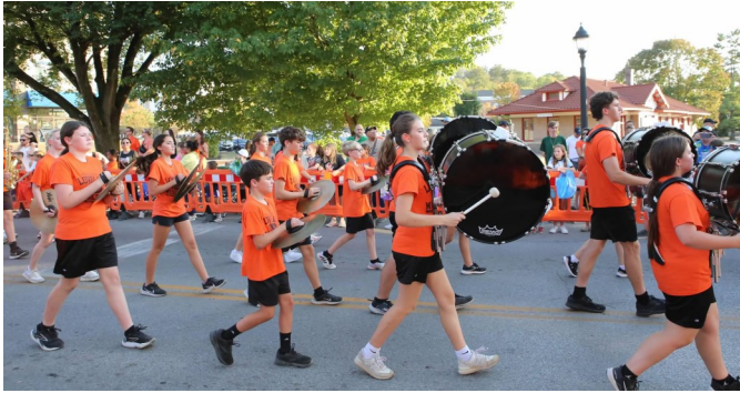
Annual Homecoming Parade comes through Downtown on Thursday