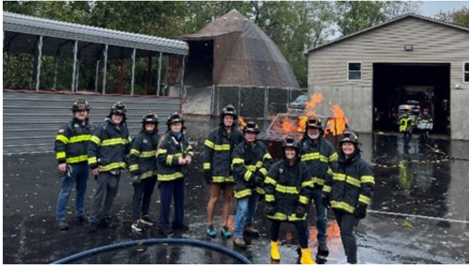
Loveland-Symmes Fire Department Hosted Loveland U this Week.