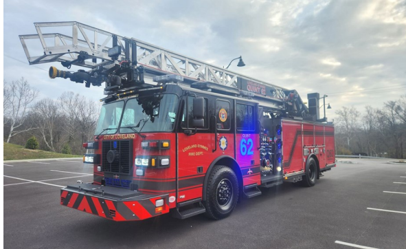
The new Quint 62 Ladder Truck arrives for service