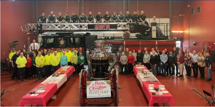
Wednesday, City Staff were hosted by LSFDF at the Safety Center for our annual Christmas Luncheon