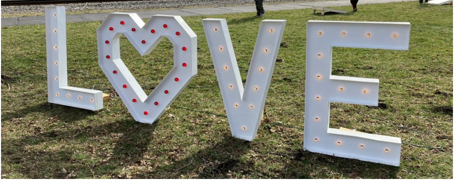
Hearts Afire Weekend Kicks Off Tonight