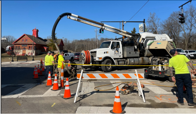
Public Works Repairs Water Main on East Loveland