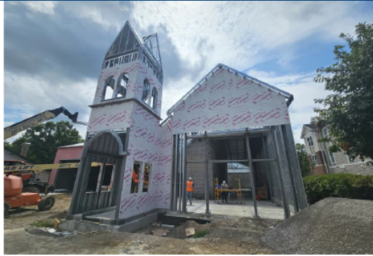
Fire Station 63 Continues to Progress