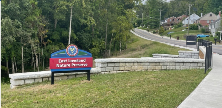
New signage at the East Loveland Nature Preserve