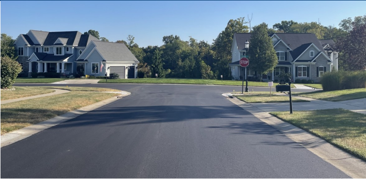
City's Annual Road Program Nearing Completion