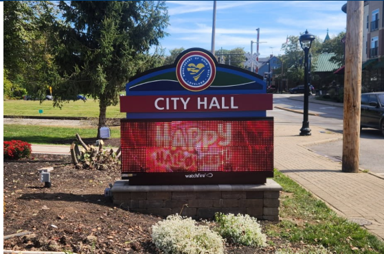
New Message Center Sign Installed at City Hall