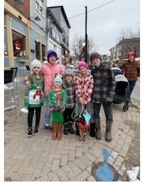
2025 Christmas Tree Lighting Festival is a Big Success