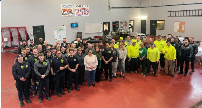
Tuesday, LSFd hosted City Staff at the Safety Center for our annual Christmas Lunch